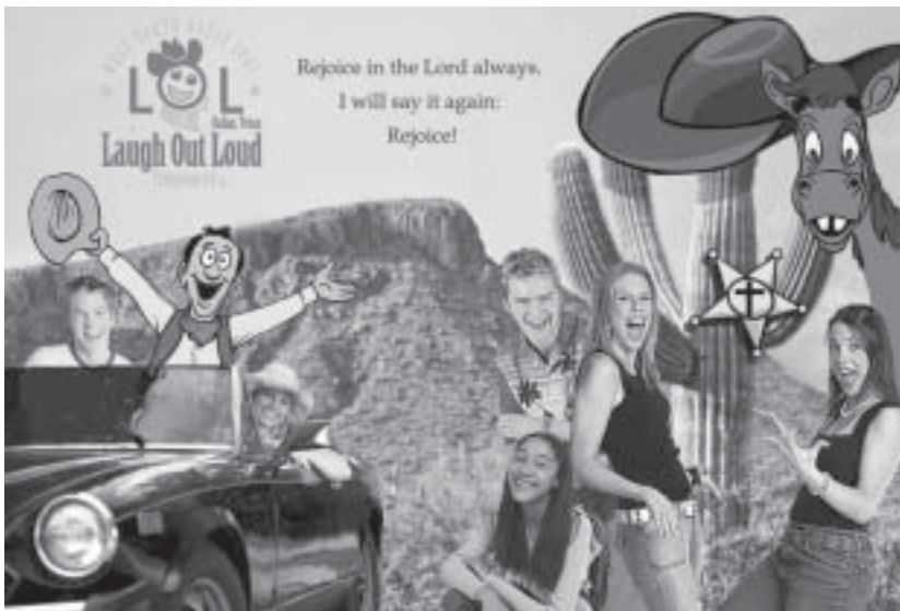
WELS Youth Rally 2007

"Rejoice in the Lord always. I will say it again: Rejoice!" ~ Philippians 4:4